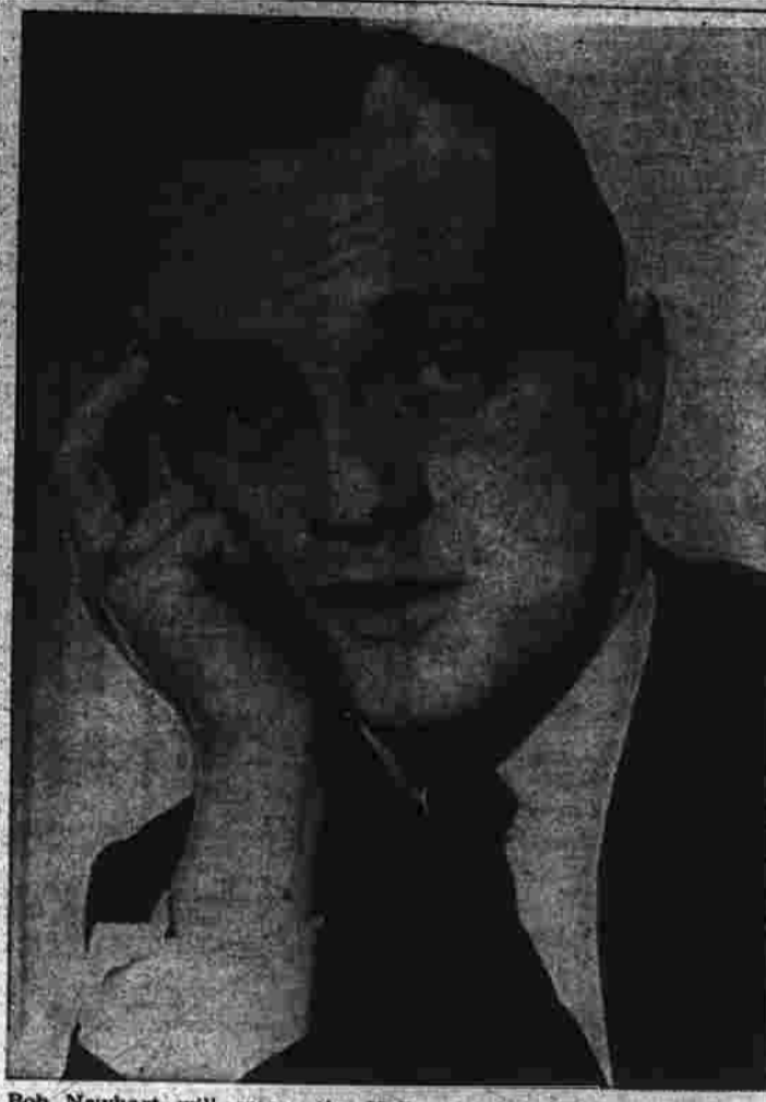
Bob Newhart will emcee the Hollywood segment of NBC-TV's "Emmy Award Show," emanating from the famed Palladium ballroom Tuesday, May 22 (10-11:30 p.m. PDT).

When the annual awards come up, viewers often wonder who received the first "Emmy" statuette. These—there were only five—were presented at the Hollywood Athletic Club on Jan. 25,